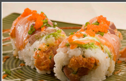
WILLIAM ROLL 12.00 (Spicy Creamy Tuna, Hamachi) Avocado, seared Salmon, Onion, Tobiko and Spicy Sauce