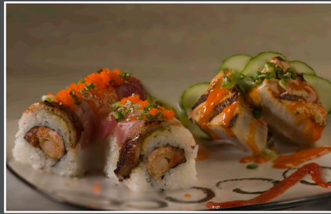
S.O.S 16.00 (D.F. Shrimp, Spicy Tuna, Snow Crab) Avocado, Tuna, Salmon Albacore, Eel, Onion, Tobiko and 2 pieces BBQ Tuna