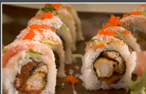
GODZILLA 11.00 (D.F. Shrimp, Spicy Tuna, Eels) Avocado, Shrimp, Snow Crab, Onion, Tobiko