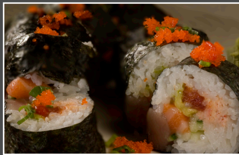
WHAT ABOUT IT 12.00 (Spicy Tuna, Salmon, Albacore, Snow Crab, Avocado, Cucumber, Onion) Tobiko, Spicy Sauce