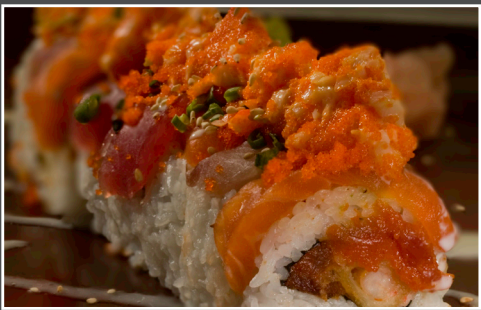
B-ROLL 13.00 (D.F. Shrimp, Spicy Tuna) Avocado, Salmon, Tuna, Hamachi, topped with mixed Shrimp