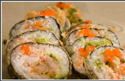
BRENDA SPECIAL 15.00 (D.F. Shrimp, Snow Crab, Yellow Tail, Shrimp, Avocado) Deep, Fried served with Brown Sauce