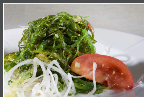
Seaweed Salad 5.00