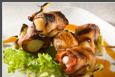
Bacon Scallops 6.00