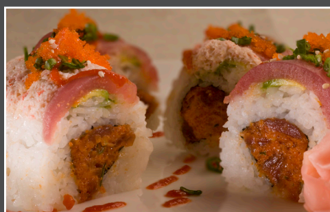
OUT OF CONTROL 10.00 (Spicy Creamy Tuna, Cucumber) Avocado, Tuna, Snow Crab, Onion, Tobiko and Spicy Sauce