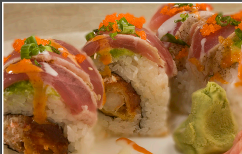
ASK 13.00 (D.F. Shrimp, Spicy Tuna, Snow Crab) Avocado, Seared Tuna, Onion, Tobiko and Garlic Avocado Sauce