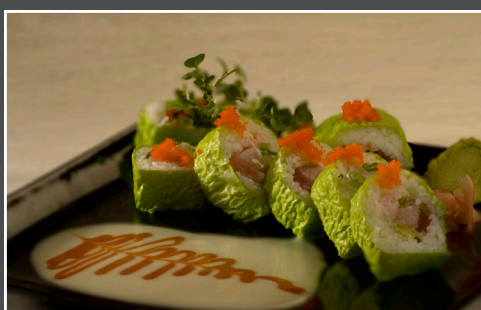
HEALTH NET 11.00 (Tuna, Hamachi, Shrimp, Radish Sprout, Avocado, Tobiko) in Soy Bean Wrap