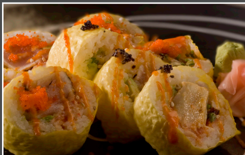
FOLSOM PRIDE 12.00 (Spicy Tuna, Seared Albacore, Snow Crab, Eel, Avocado, Onion, Tobiko) in Soy Bean Wrap