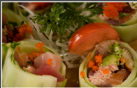
Q MAKI 11.00 Cucumber Skin Wrap, Tuna, Snow Crab, Albacore, Salmon, Eel, Avocado with Citrus Sauce

DISNEY 10.00 (D.F. Shrimp, Snow Crab) Avocado, Salmon, Eels, Onion, Tobiko