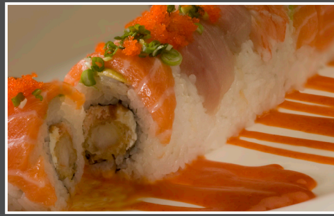
KINGS 14.00 (D.F. Lobster, Snow Crab) Avocado, Tuna, Salmon, Albacore, Onion, Tobiko