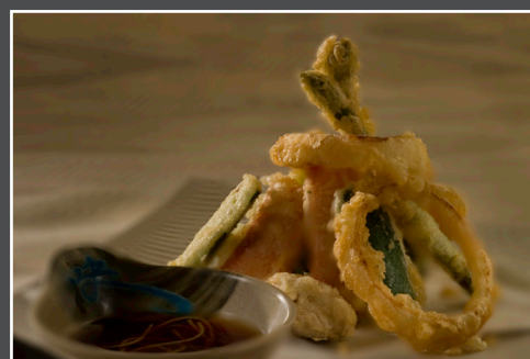
TEMPURA MIX 6.00