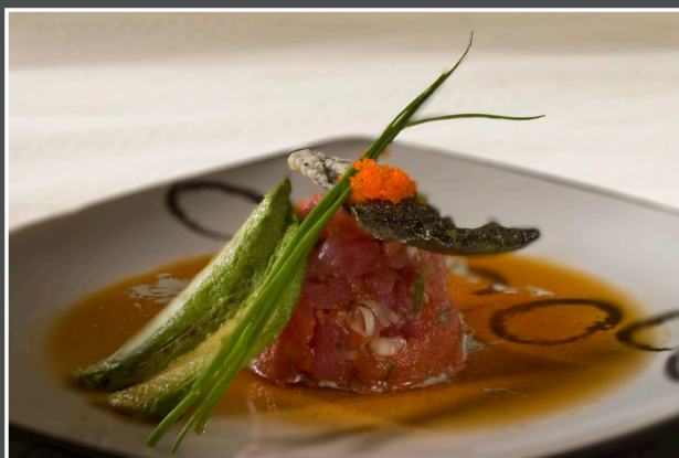
Tuna Tartare 11.00

TUNA TARTARE 11.00 Finely mixed Tuna, Onion, Tobiko, served with Wasabi Ponzu Garnished with Cucumber