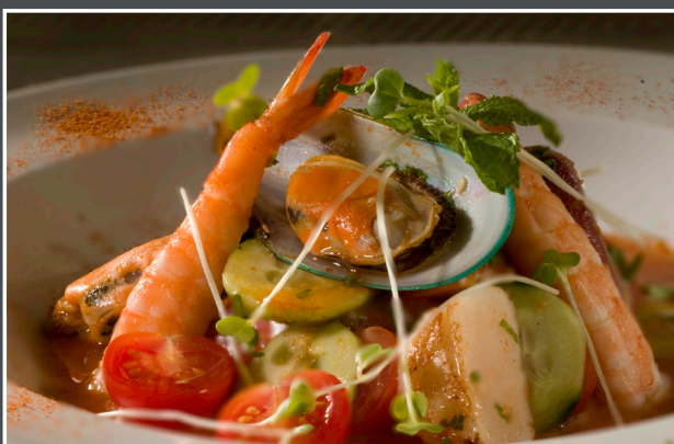
Seafood Ceviche 14.00

SEAFOOD CEVICHE 14.00 Boiled Shrimp, Octopus, Mussel, mixed with Scallop, Salmon, Tomato, Cucumber in Ceviche sauce garnished with Sprout