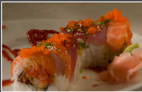
PETER # 2 12.00 (D.F. Shrimp, Spicy Tuna, Cucumber) Avocado, Tuna, Salmon, Hamachi, Onion, Tobiko