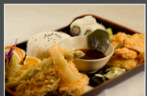
Bento box #11 10.00/14.00