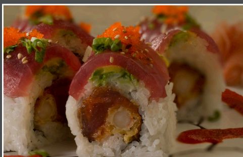
RED DRAGON 10.00 (D.F. Shrimp, Spicy Tuna) Avocado, Tuna, Onion, Tobiko