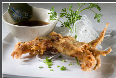
Blue Crab 7.00