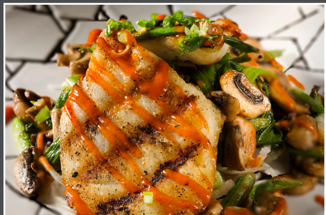
Chilean Sea bass

Thinly sliced Salmon served with Onion Vinaigrette garnished with Radish Sprout