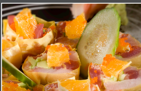
RICELESS 16.00 (Tuna, Hamachi, Salmon, Albacore, Spicy Tuna, Snow Crab, Avocado, Cucumber) in Soy Bean Wrap Without Rice