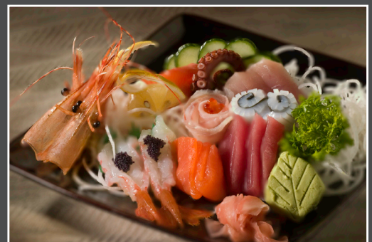
Mix Sashimi 10.00