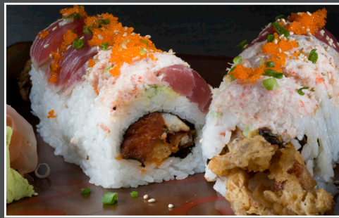
KIM # 3 14.00 (Soft Shell Crab, Spicy Tuna, Eels) Avocado, Seared Tuna, Snow Crab, Onion, Tobiko