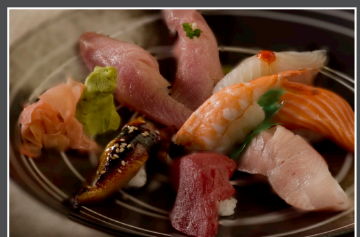
5 Piece Start 7.00