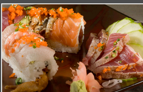
SAM'S RAINBOW 16.00 (Soft Shell Crab, Spicy Tuna) Avocado, Tuna, Albacore, Ebi, Eel, Salmon, Hamachi, Onion, Tobiko and 5 pieces Seareded Ahi