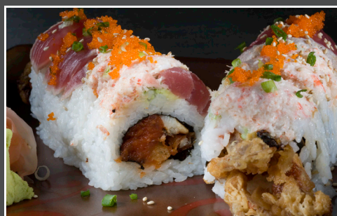
MARILYN MONROLL 12.00 (D.F. Shrimp, Spicy Tuna) Avocado, Snow Crab, Tuna, Scallop