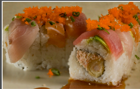
KAISER 11.00 (D.F. Shrimp, Snow Crab) Avocado, Tuna, Hamachi, Salmon, Onion, Tobiko