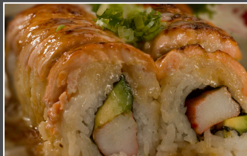
LION KING 11.00 California Roll, Salmon, baked with Special Creamy Garlic Sauce