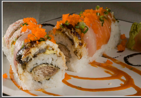
IRON POINT ROLL 14.00 (D.F. Fish, Albacore, Eels, Salmon, Snow Crab, Avocado) Tobiko, in Soy Bean Wrap