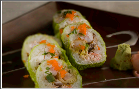
PAYCHECK 12.00 (D.F. Shrimp, Eel, Snow Crab, Ebi, Cream Cheese, Avocado) in Soy Bean Wrap