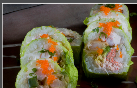
MIAMI 13.00 (D.F. Shrimp, Spicy Tuna, Cream Cheese, Snow Crab, Salmon Avocado, Onion) Tobiko in Soy Bean Wrap