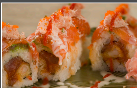
PINK DRAGON 11.00 (D.F. Shrimp, Spicy Tuna) Avocado, Salmon, Spicy Crab mix, Onion, Tobiko