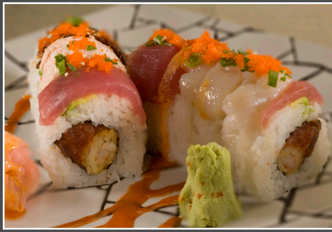
ANTHONY SPECIAL 13.00 (D.F. Shrimp, Spicy Tuna) Avocado, Tuna, Scallop, Snow Crab, Eel, Onion, Tobiko