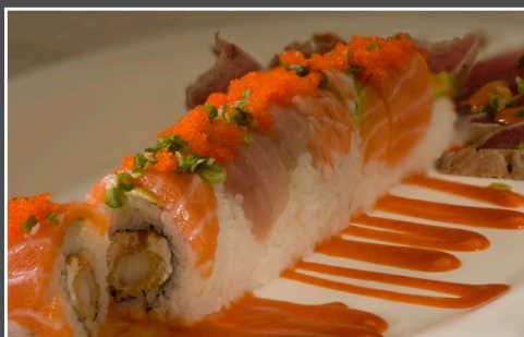
PETER K.P. 16.00 (D.F. Shrimp, Cream Cheese, Snow Crab) Avocado, Salmon, Shrimp, Albacore, Onion, Tobiko, and 5 pieces seared Ahi