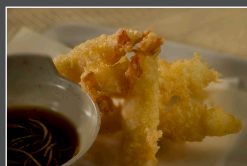
Shrimp Tempura 5.00