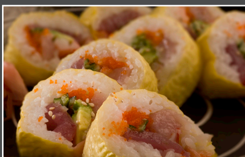
INTEL 11.00 (Smoke Salmon, Imitation Crab, Tuna, Albacore, Cucumber, Avocado, Tobiko) in Soy Bean Wrap