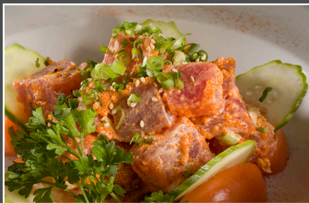
Tuna Cocktail 12.00

TUNA COCKTAIL 12.00 Fresh cubed Tuna, Avocado, Smelt Egg, green Onion, marinated with spicy creamy Wasabi, served on a bed of Radish in Avocado shell