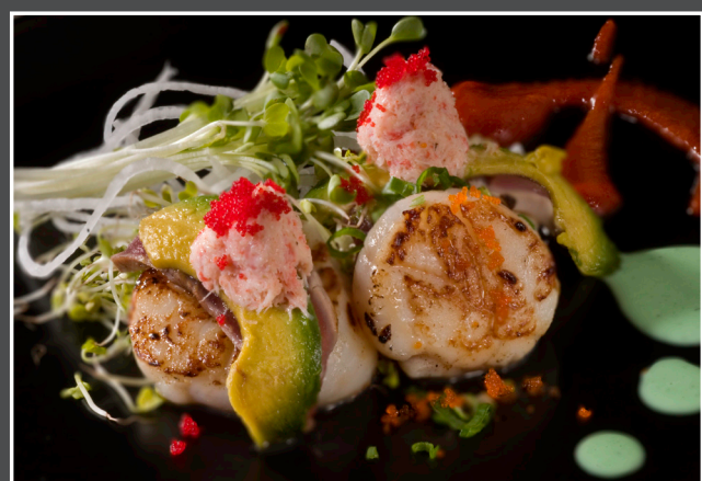
SC hors d'oeuvres