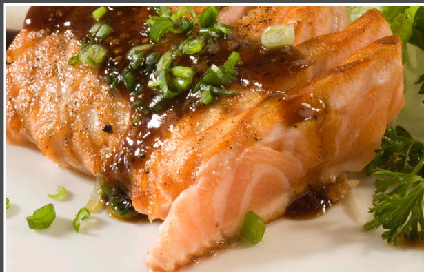
Peppercorn Salmon 13.00

PEPPERCORN SALMON 13.00 Lightly seareded Fresh Salmon, served with Wasabi special pepper-sauce and garnished with Sprouts